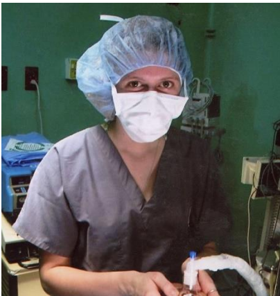
Hearts in Motion Medical Mission trips to Guatemala