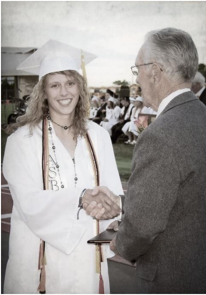
Ephrata High School June 2008