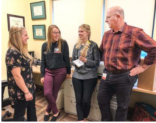
University of Washington School of Medicine Class of 2021