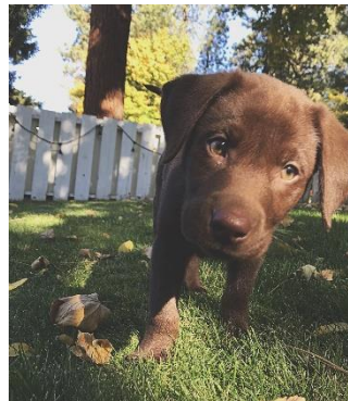
The puppy: Jack