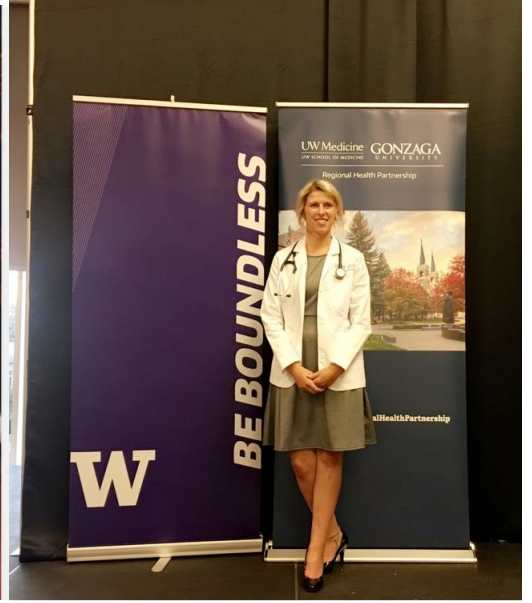
White Coat Ceremony - 2017